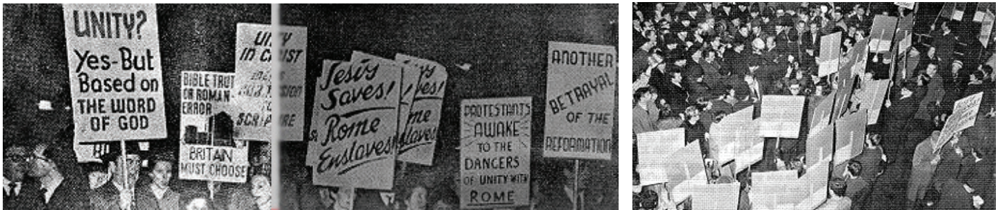
The demonstrators outside the cathedral with their banners

The ringleaders of the vicious mob were Irish Papists. None of these Papists were arrested. They cried, "One man, one vote" and "This is a free country". Their attacks proclaim that the only freedom popery recognises