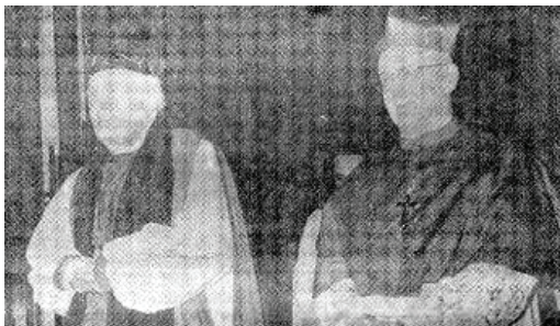
Archbishop Ramsey and Cardinal Heenan

The scene was set. St. Paul's was just right for the arrival of the anti-Christ. A large stone crucifix, the flickering flame of four great wax-dripping candles and the breathless expectancy of the congregation spoke volumes of the lavish preparations for HIS arrival.